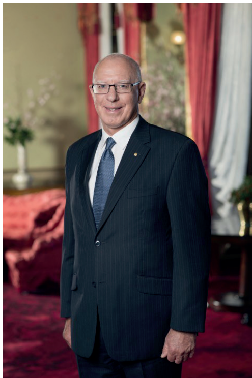
His Excellency The Honourable General David Hurley AC DSO (Ret'd.)